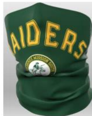
Raiders Gaiter $9.50