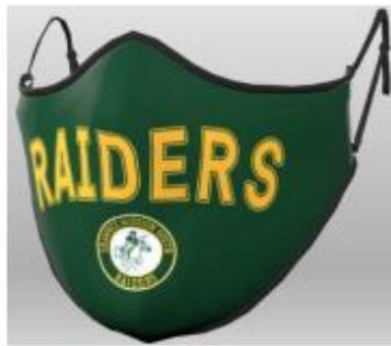
Raiders Mask $9.00